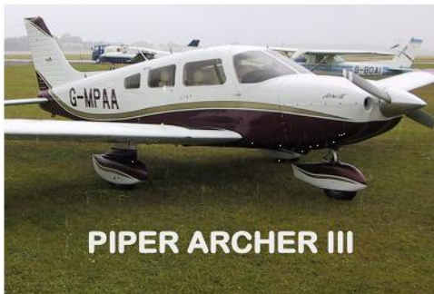
PIPER ARCHER III

Saturday 23rd July saw the successful launch of the MPFC's new aircraft with a Bar-B-Q in the afternoon followed by a raucous party in the evening until the early hours in the 'Pilots Pals Bar'