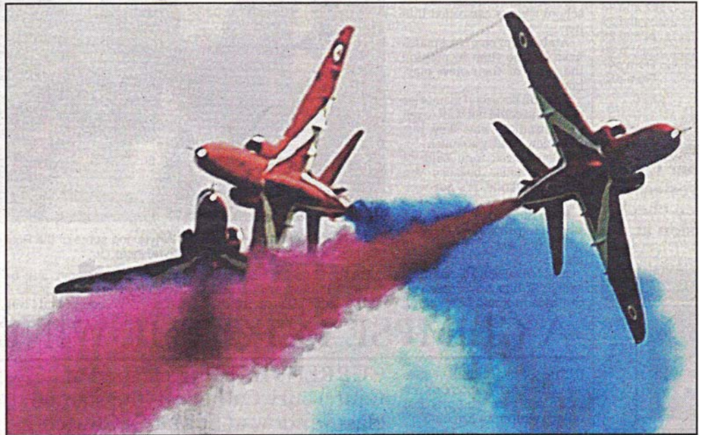
ON DISPLAY: The Red Arrows during a performance at Biggin Hill Air Fair

been problems in 2012 because of the Olympics, but added it was nothing that couldn't have been negotiated.